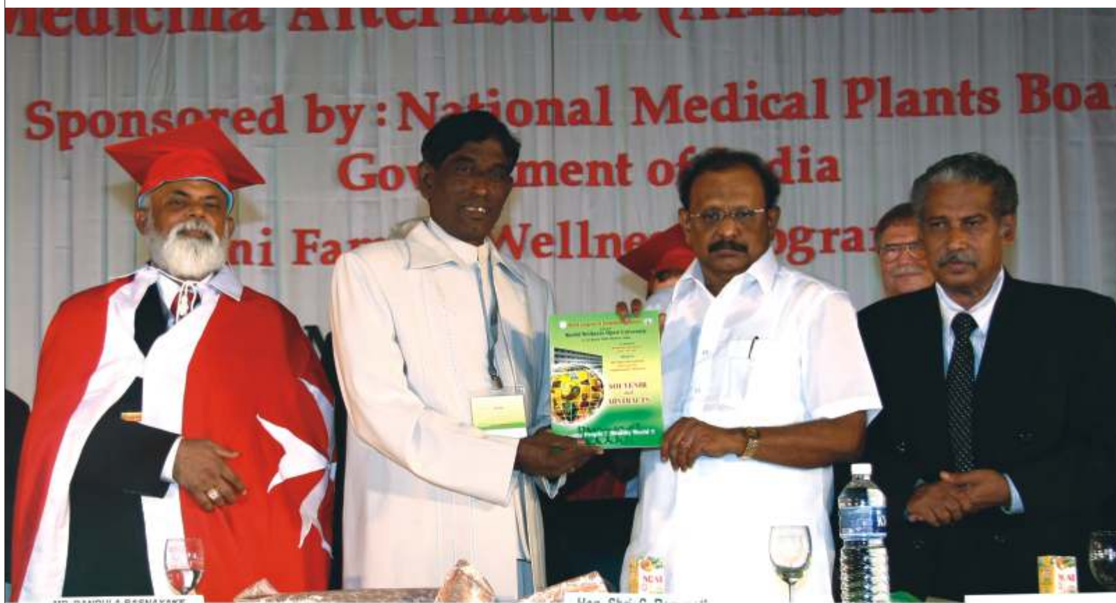
Release of Publications, The Souvenir and Abstracts by Hon'ble Minister for State, Ministry of Environment and Forest, Government of India Sri. S. Reghupathy and Minister of Sports, Mr. Bandula Basnayake Srilanka