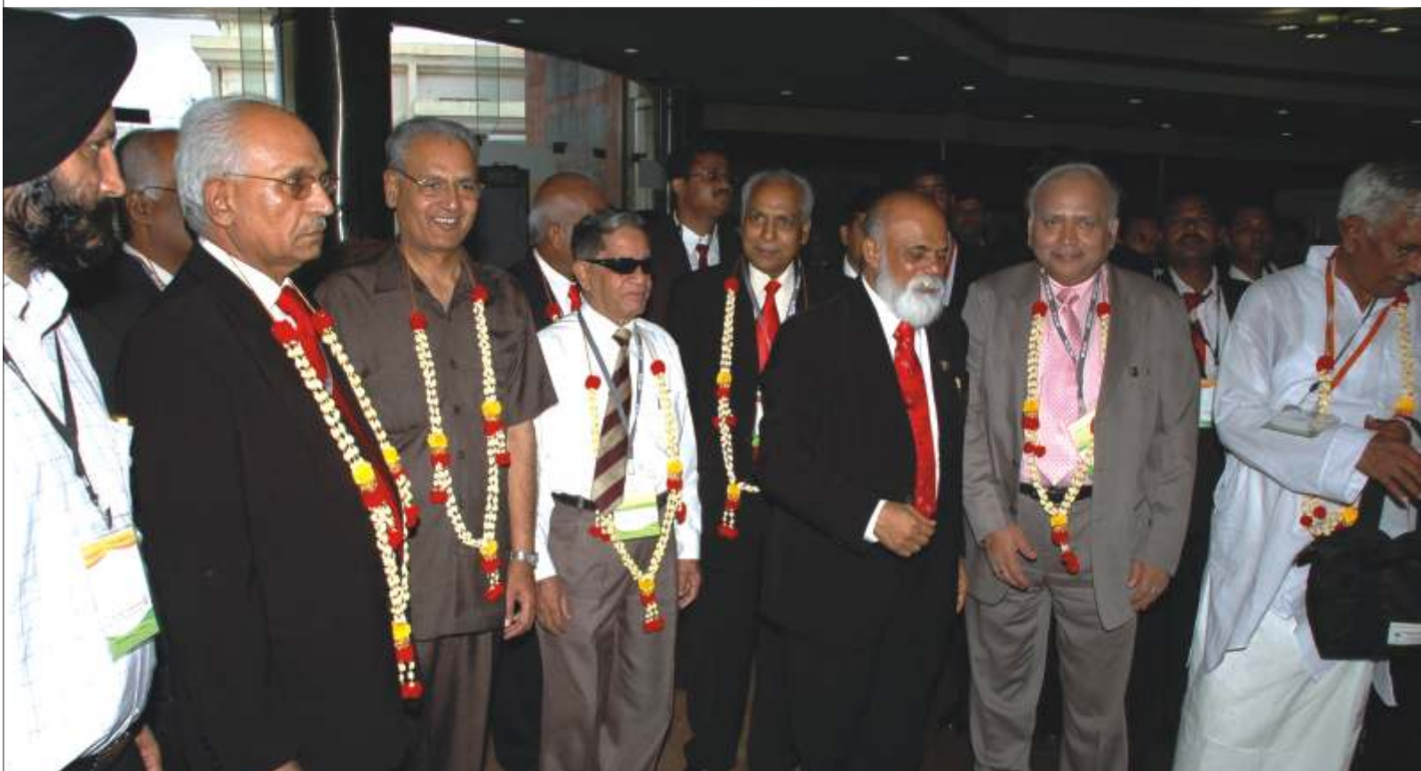
Welcoming of VVIP from W NRF and Members of National Organising Committee