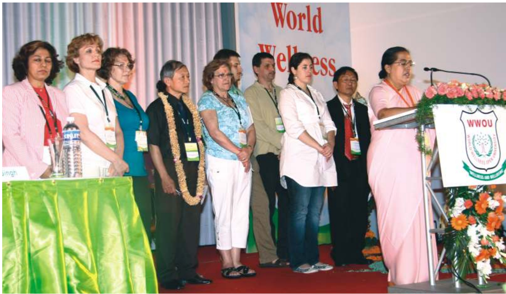
Participation of Foreign delegates from Europe.