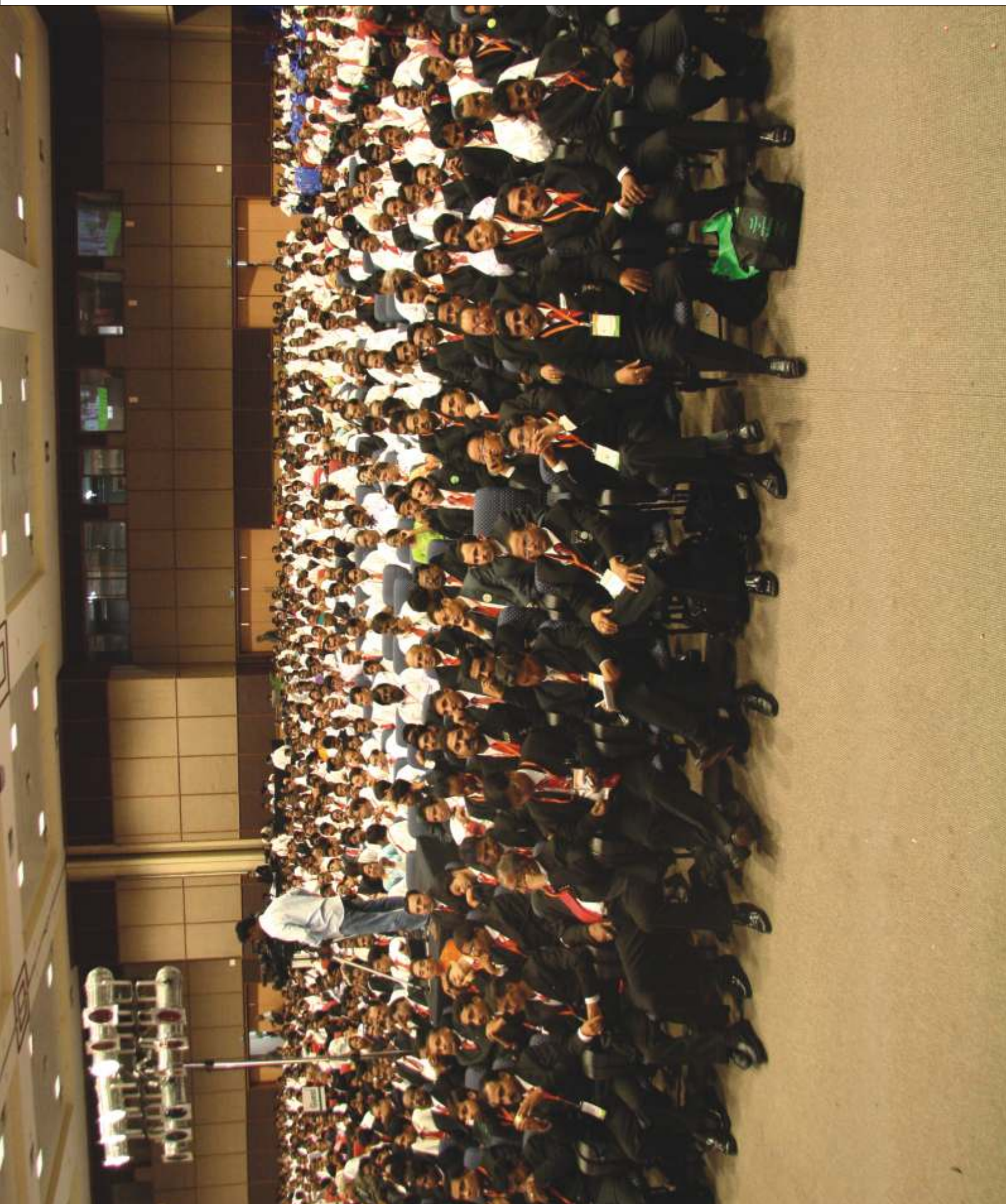
More than 2500 participants and delegates across the World participated in the great event.