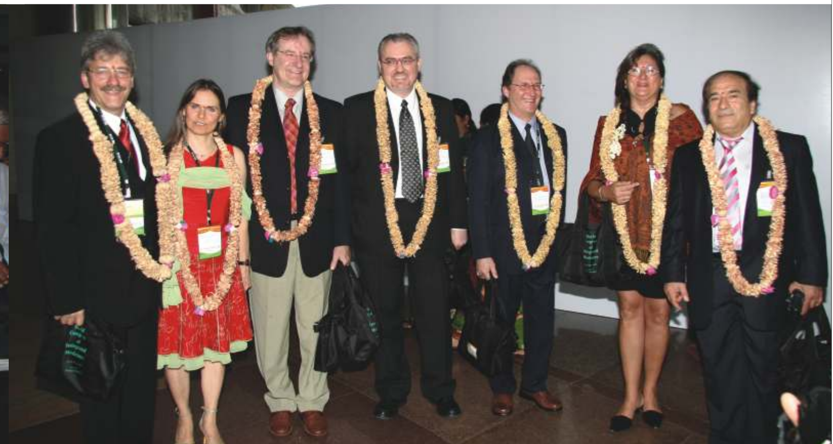
Welcoming of Foreign Delegates from North America