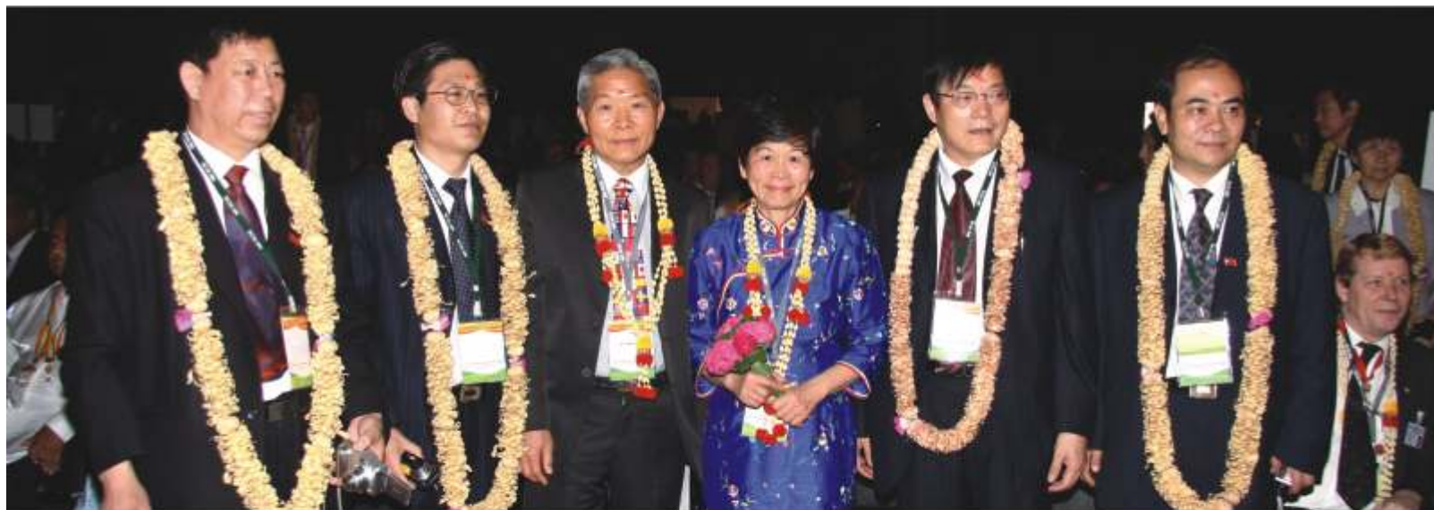
Welcoming of Foreign delegates from China.